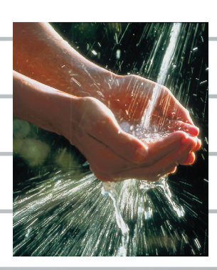
Fields of Application